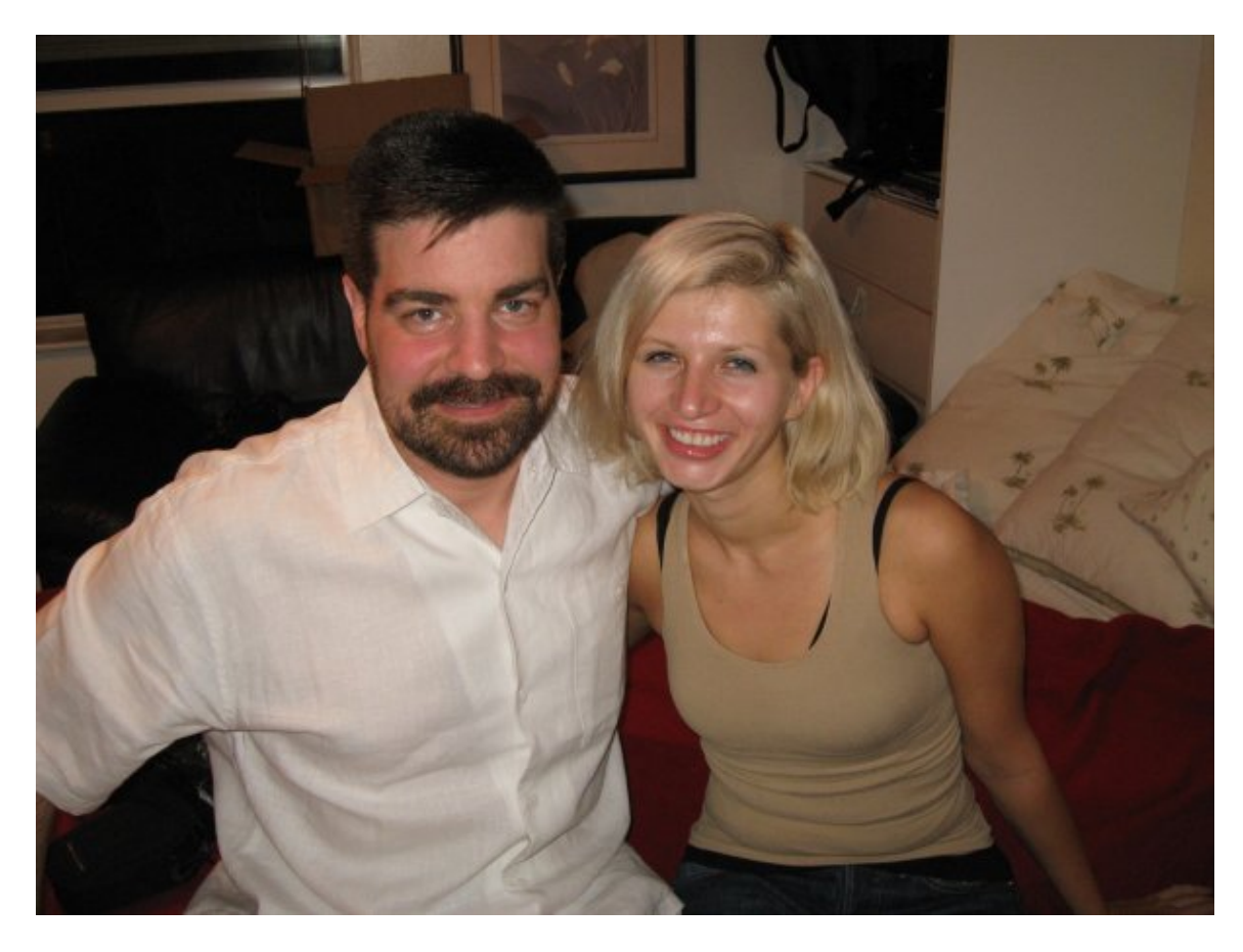
Healthy people don't just look younger; they live longer too and have significantly less disease.